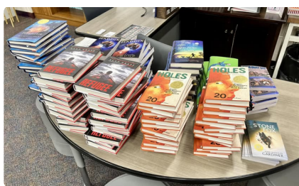
4th Grade Classroom Libraries