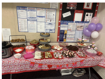
February Sweet Treats for Staff

PTO funds were used to enrich learning in 5th grade with interactive STEM games and new Read Aloud books.