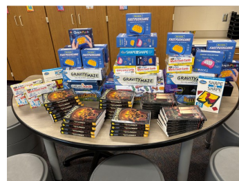
5th Grade STEM Supplies